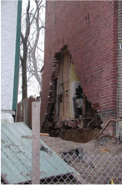
Collapsed wall of 1365 Florida Ave caused by construction at 1367 Florida Avenue