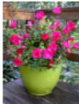
knock roses (multi-colored)