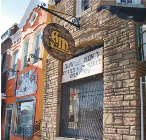
Projecting sign on bracket provides small-scaled, visible signage for pedestrian. Flat sign in window appears to be plywood, but may wear out quickly.