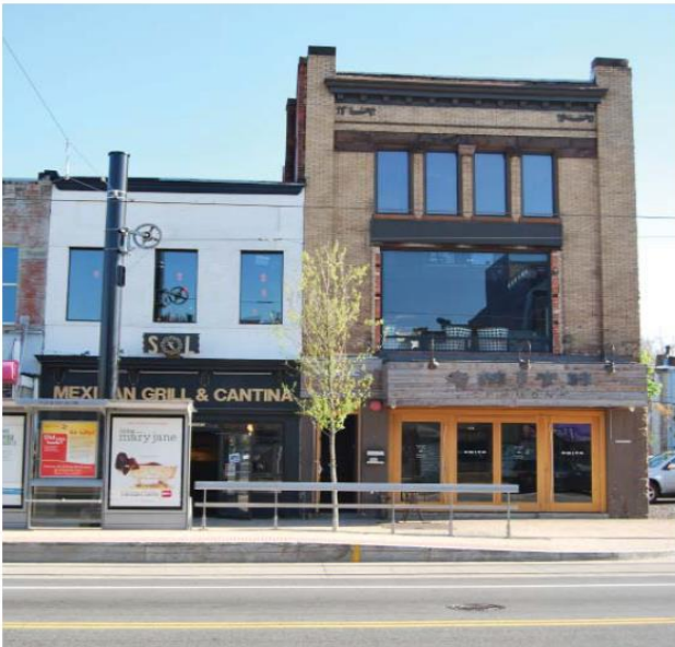
"Sol" sign has two applications, painted and raised letters. Painted sign is well located in the horizontal band between floors. "Smith Commons" sign is located on applied board within horizontal band in a more modern application.