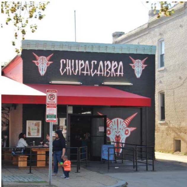
Painted words and images give visual interest, good scale and placement on the facade.