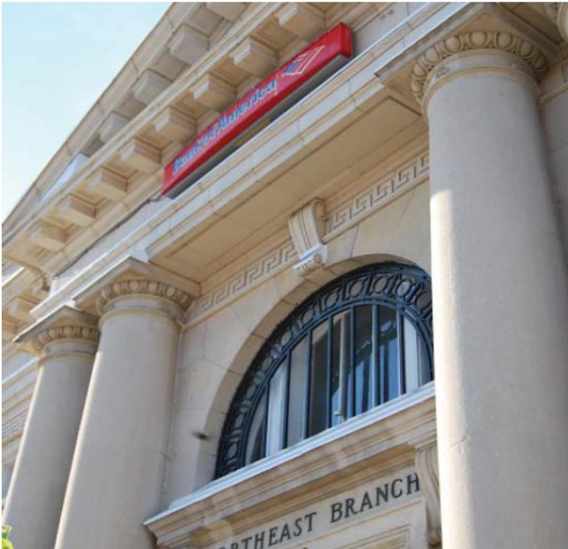
"Northeast Branch" signage is historic example of lettering applied to fascia. However, the "Bank of America" signage appears incongruous to the classical, architectural facade elements. Also, concealment of electrical conduit is preferred.