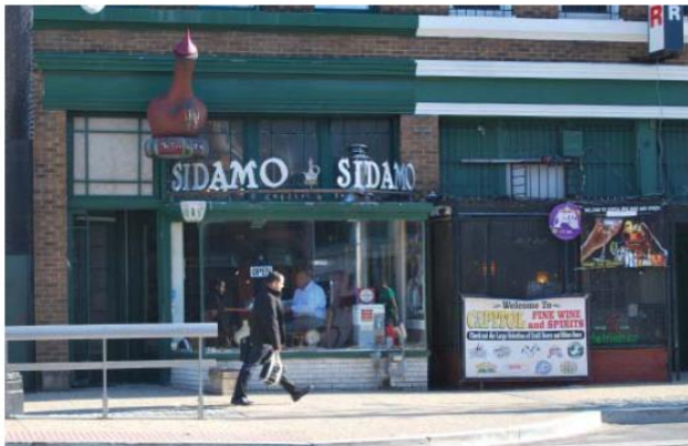
Creative and active three-dimensional sign with letters and imagery "sits" on bay window, taking advantage of its depth. Very visible and dynamic application.