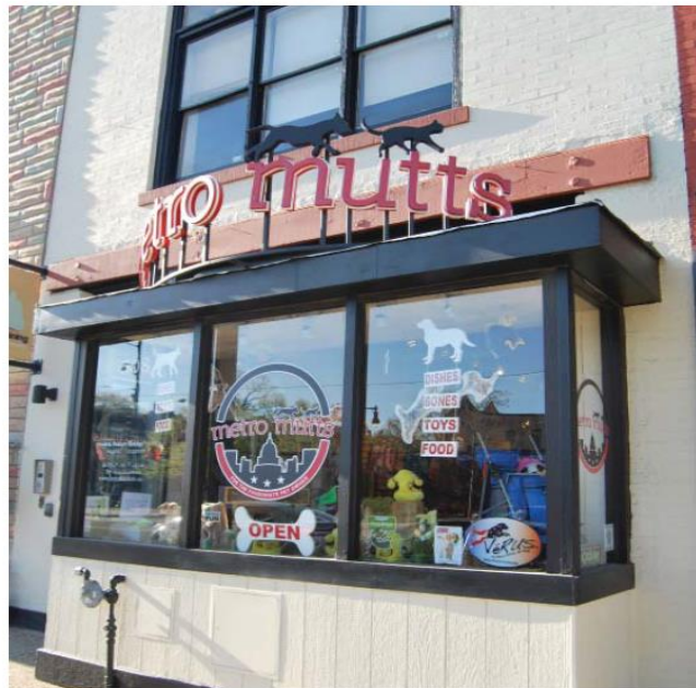
Whimsical example of lettering with themed-animal cutouts is eye-catching to customers and automobiles passing by. Window decals further complement signage, providing additional reinforcement of branding. The signage is another example of visual interest, scale and placement on the facade.