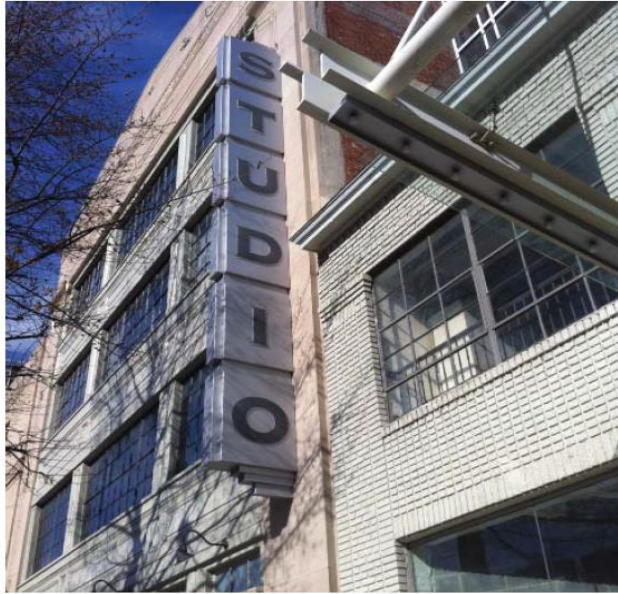
Vertical projecting sign is legible and addresses scale of the building while creating a rhythm by giving each letter a "box". Art Deco design of the sign enhances the architectural style of the building.