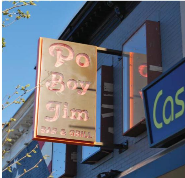
Vertical projecting sign with lighting has a careful relationship (in height and placement) to the adjacent second floor windows. Interesting visually, with lettering cut out of metal panel. Signage material complements materials of the building facade.