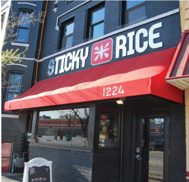
Painted and applied signage with awning gives good visibility at scale of street and sidewalk. Horizontal band of lettering enhances datum at building facade.