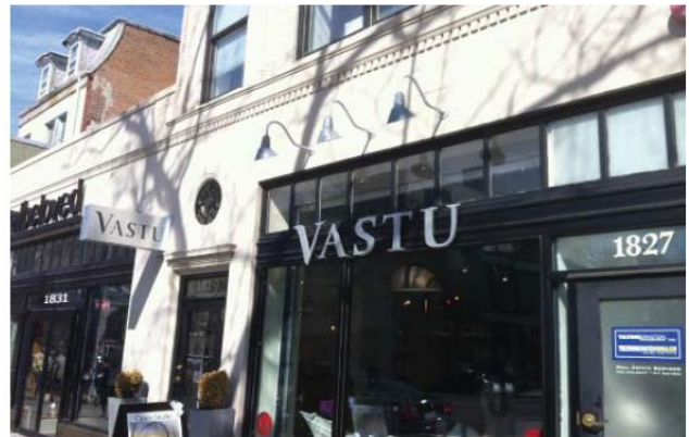
Example of blade and wall lettering signage styles with directional lighting. The sign and lighting relate to the architectural features of the building facade. The blade sign is visible to both pedestrians passing up and down the corridor as well as vehicles driving by. The wall lettering provides additional reinforcement of branding.