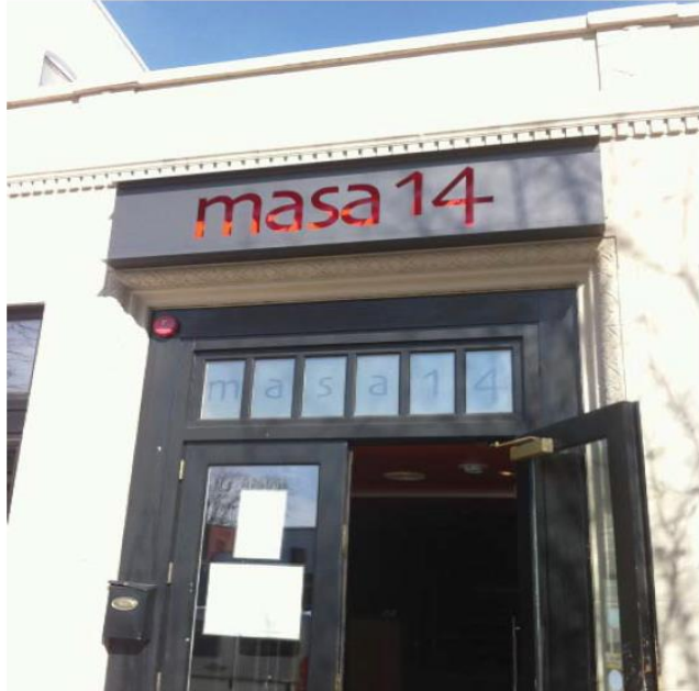
Example of die-cut lettering on metal signage, with additional reverse window signage below, however, the signage appears "crammed" in between the architectural elements of the building facade..