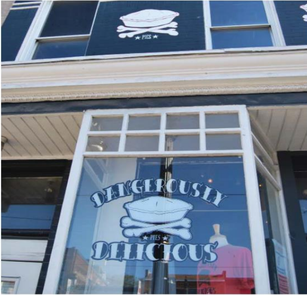
Painted "logo" (picture) on brick and window relate to scale of the pedestrian and the building/streetscape. Signage is nicely scaled and related to the architectural elements (windows/space between windows). Use of window decal is another economical option.