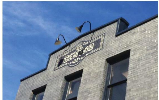
Painted signage at top of building evokes subtle historic painted lettering. Letters are subtle and respectful of facade (contained in a box).