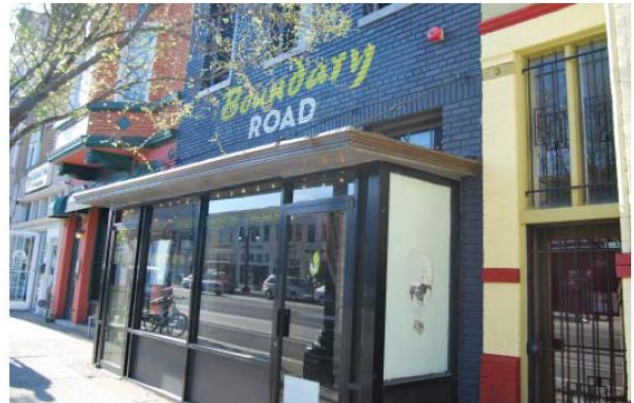
Painted signage has visual interest with color, font type and placement above the bay window. Evokes modern interpretation of historic painted signage and provides an economical signage style option for businesses.