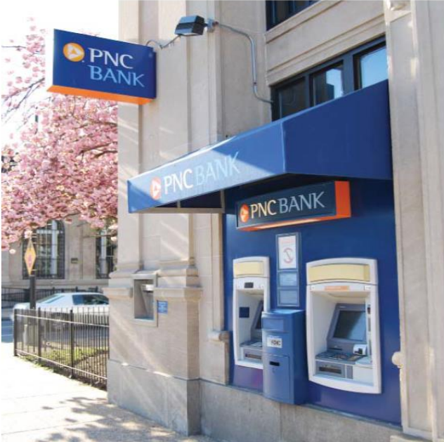
The awning provides shelter to ATM customers from sunlight and poor weather and the blade sign offers additional branding to passing customers, however the sign materials appear cheap (vinyl, plastic). The signage placement doesn't enhance the facade design and appears tacked on, possibly damaging the existing building (insertion of ATM in opening).