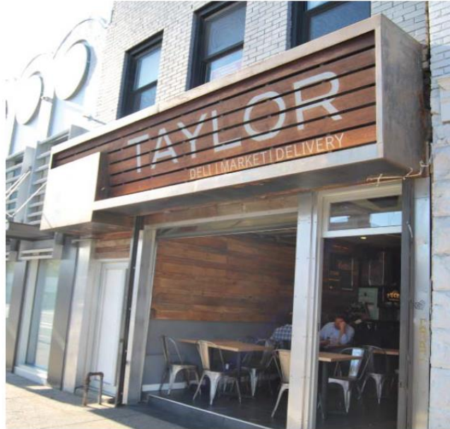
Modern sign at building entry, acts as a cover at the entrance. Sign piece obscures second floor windows. Tasteful materials to complement the simplicity of the building.