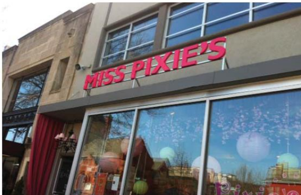
Minimalist lettering frame is respectful intervention (not heavy mounting), providing shadow and color for visual interest. Signage placement on top of bay window allows pedestrian visibility and marks building entrance.