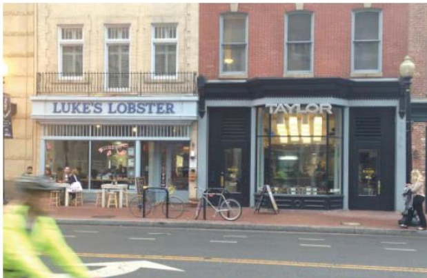
Examples of applied lettering located within or adjacent to an architectural element. "Luke's" sign is well placed but individual letters are slightly too tall, out of scale to the sign area. The nicely scaled "Taylor" sign unobtrusively hangs from the fascia in a more modern style, but does not have direct relationship to architectural elements.