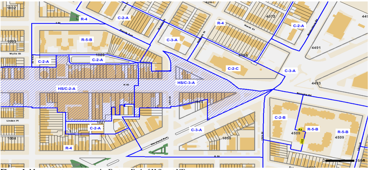
Figure 1: Map current zones on at the Eastern End of H Street NE.

The current zoning in the area surrounding the Eastern End of H Street NE is inconsistent with the Future Land Use Map in the 2006 Comprehensive Plan. For example the Maryland Ave facing lots in Squares 1027 and 1049, the 15<sup>th</sup> St, the western portion of Square 4509, all lots on Square 1050 and C-3-A zoned lots in Square 1026 are all commercially zoned (see Figure 1) but designated as moderate density residential land-use in the Future Land-Use map. In addition, future land use map shows that the density of the commercial lots on H Street between 12<sup>th</sup> and 15<sup>th</sup> should be less dense than the commercial area between 7<sup>th</sup> and 13<sup>th</sup> St. However, the current zoning is inconsistent with the future land-use map because many of the lots on H Street between 13<sup>th</sup> and 15<sup>th</sup> are zoned C-3-A while the lots between 10<sup>th</sup> and 13<sup>th</sup> are zoned at the less dense C-2-A zone.