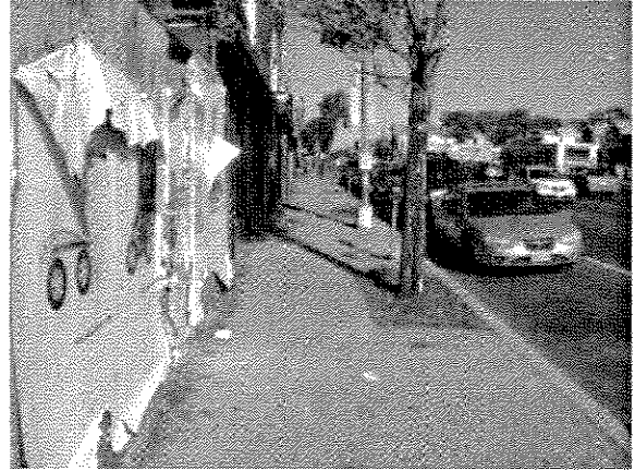
800 block of H Street, NE posters from various groups posted to vacant building, light poles, and utility corridors