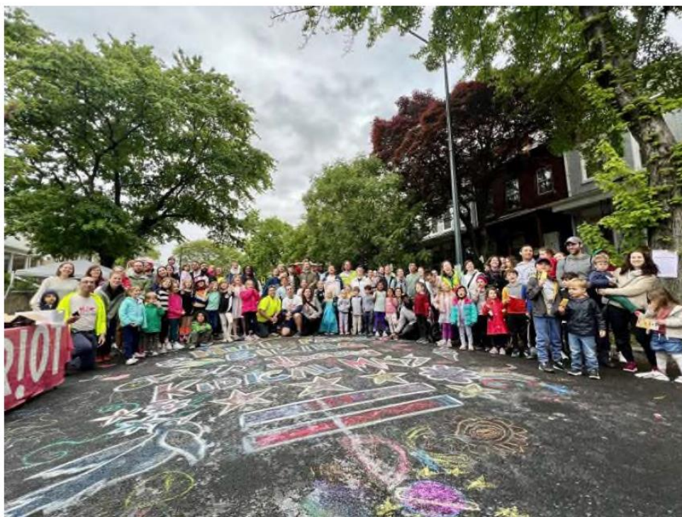
Members of Hill Family Biking around a mural created by Chalk Riot at the anniversary block party.

The bikes begin to swoop in, one by one, a trickle, then a deluge, turning from Tennessee Avenue toward 13th Street NE. They come in all sizes and colors, some with streamers and signs, many with kids on the back, buckets in the front or trailers behind.