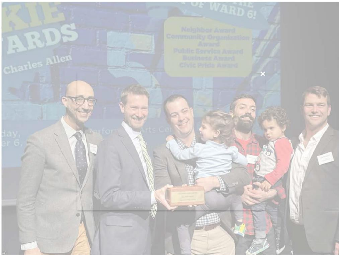
Organizers with Hill Family Biking accept the Civic Pride Brickie.

Meet The Winners of the 2023 Brickie Awards | HillRag