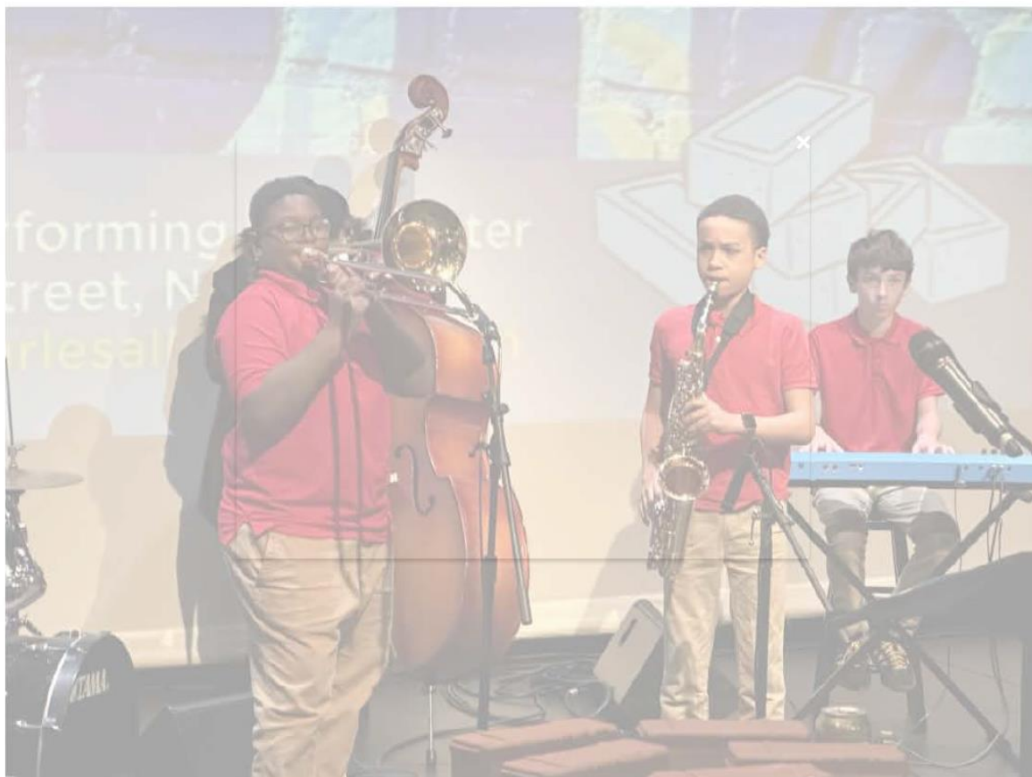
Musicians from Stuart Hobson Middle School began the night with some Miles Davis.