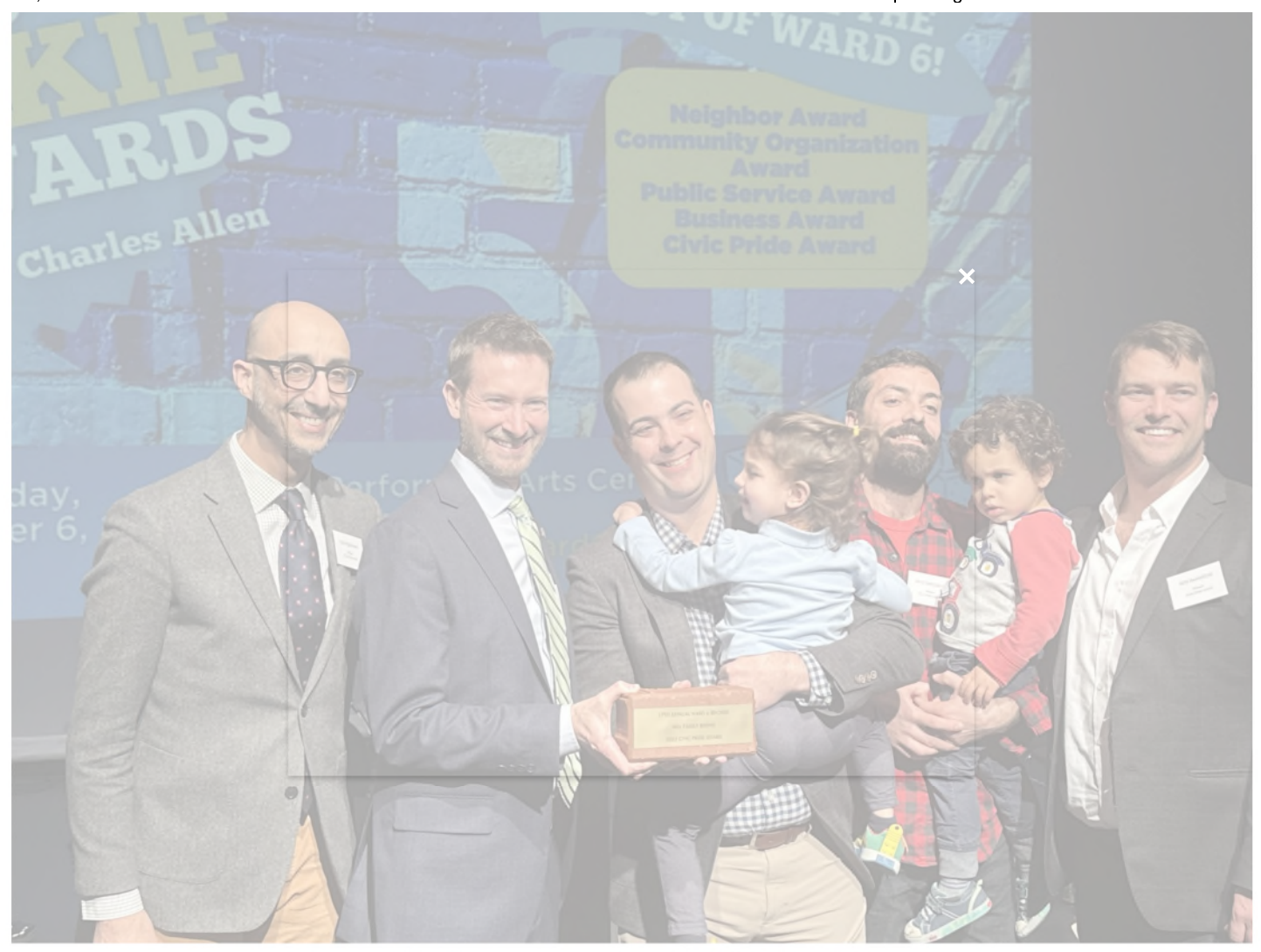
Organizers with Hill Family Biking accespt the Civic Pride Brickie.