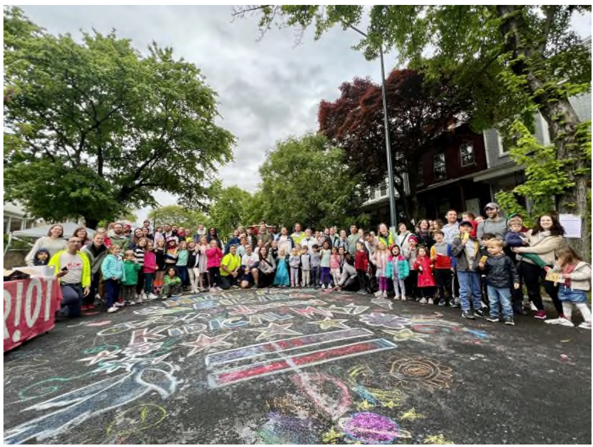
Members of Hill Family Biking around a mural created by Chalk Riot at the anniversary block party.

The bikes begin to swoop in, one by one, a trickle, then a deluge, turning from Tennessee Avenue toward 13th Street NE. They come in all sizes and colors, some with streamers and signs, many with kids on the back, buckets in the front or trailers behind.