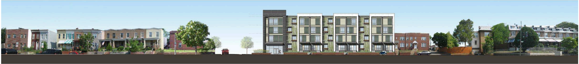
CONSTITUTION AVE. ELEVATION