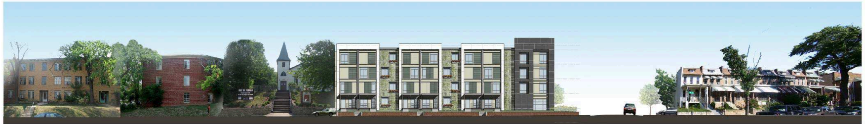
16TH ST. ELEVATION