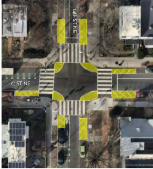
14th STREET NE & C STREET NE