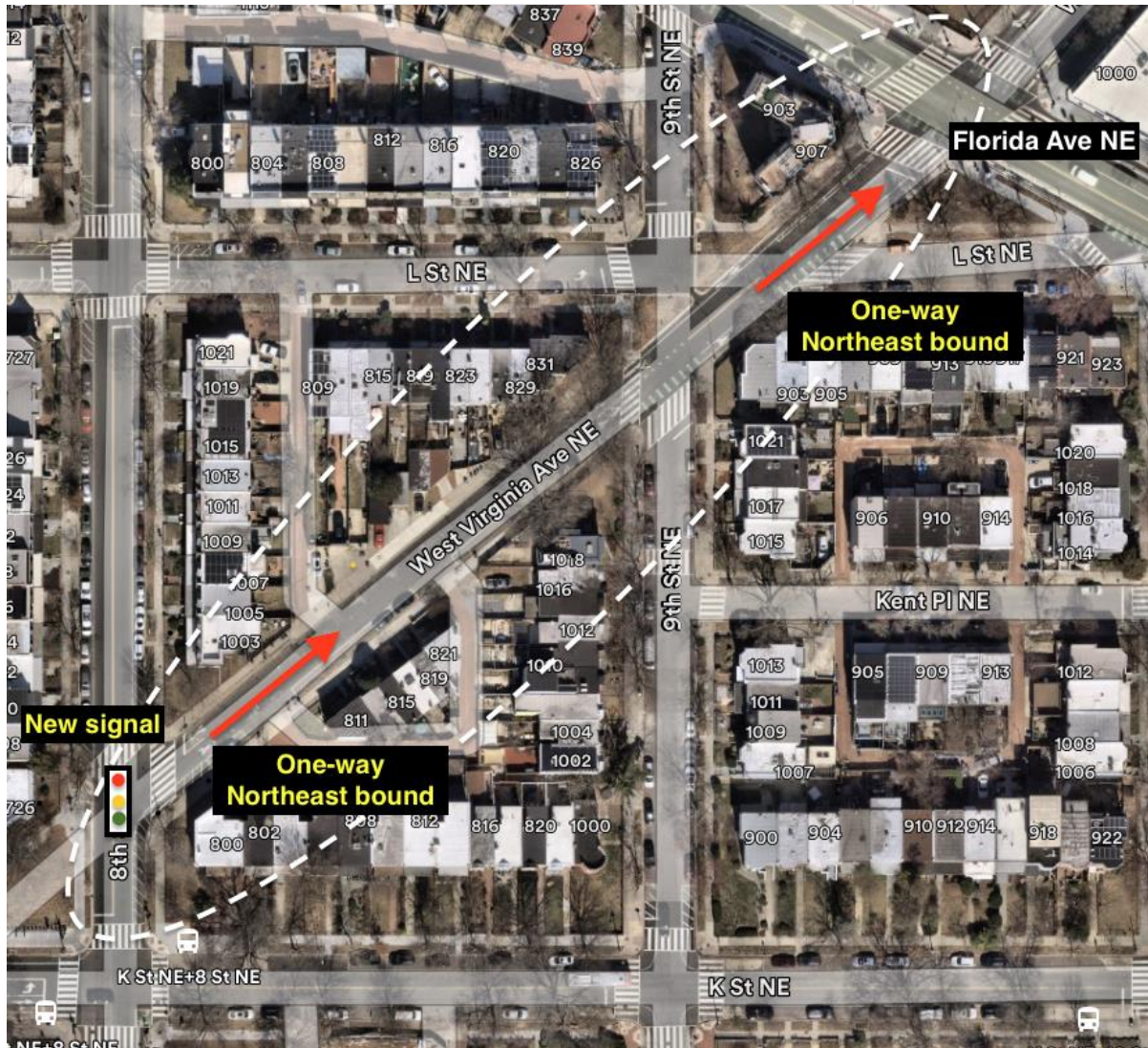
[Figure 1] Proposed one-way conversion and new signal on 800-900 blocks of West Virginia Ave NE